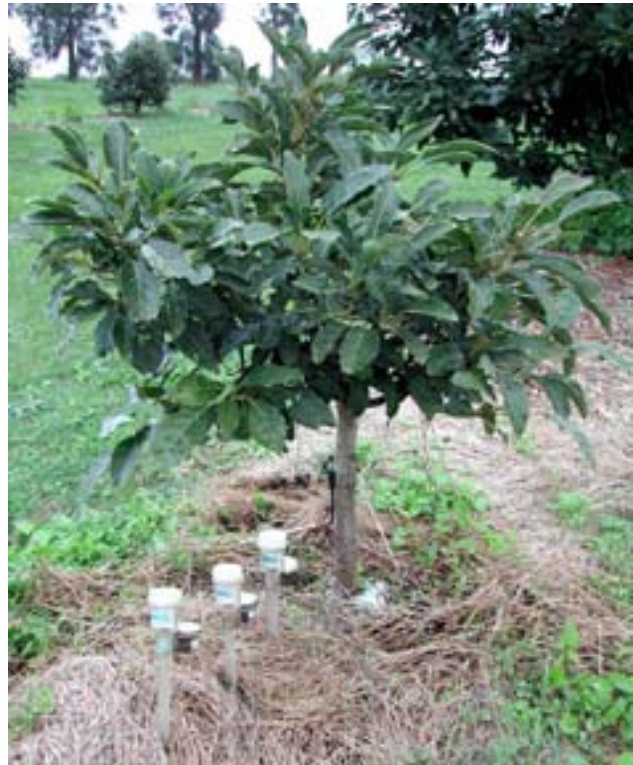
Tensiometers are being used here to record soil moisture at three depths.

Avocados are very sensitive to moisture stress, especially during flowering, fruit set and fruit development. During these critical periods the soil profile should not be allowed to dry out and tree requirements should be monitored, for example using tensiometers. Using weekly evapotranspiration figures is another useful method.