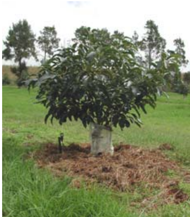
A young Hass tree with a protector sleeve around the trunk, mulch under the canopy, an interrow grass sward and irrigated with an under tree sprinkler.

Drainage and the angle at which vehicles can traverse steeper slopes may dictate the direction of rows, but generally rows should run north-south. This allows better inception of sunlight.