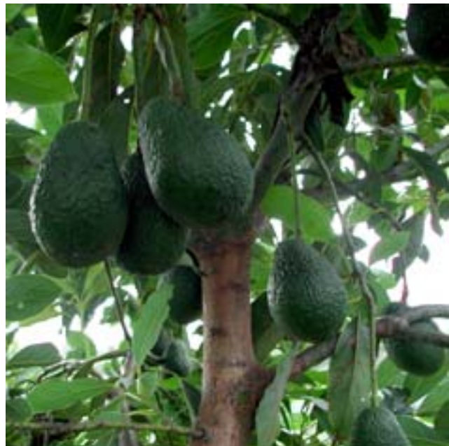
Hass fruit awaiting harvest.

The avocado belongs to the family Lauraceae. Camphor, sassafras, cinnamon and laurels are related species. The tree is evergreen, though heavy leaf fall may occur during profuse blossoming and when the tree is affected by root rot. The growth habit varies from tall and upright to well-shaped and spreading.